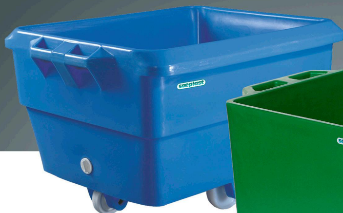
PUR Saeplast 340 Cart