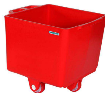
PE Sæplast 200 Buggy without bracket