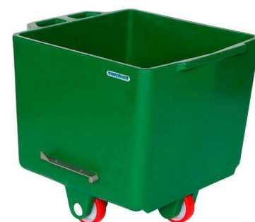
PE Sæplast 200 Buggy with bracket