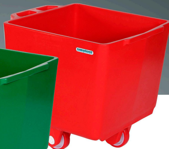
PE Saeplast 200 Buggy without bracket