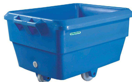
PUR Sæplast 340 Cart