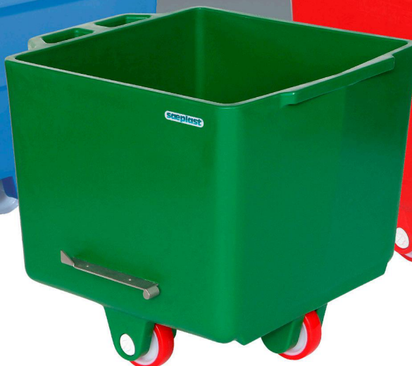
PE Saeplast 200 Buggy with bracket