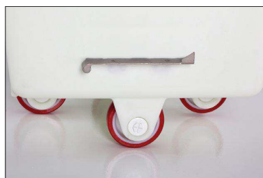
Integrated stainless steel brackets.