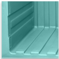
Monobloc rotomoulding. Internal convection grooves