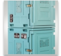
Stackable with moulded bosses