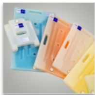
TOP 130 eutectic plate