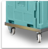
Removable castor base with 4 casters Ø 100 mm, 2 fixed, 2 swivel