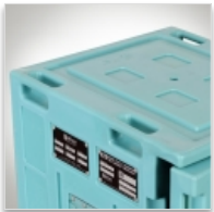
8 moulded handles