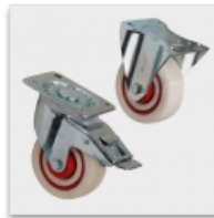
Removable castor base with 4 casters Ø 100 mm, 2 with brake