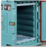
Moulded eutectic plate support