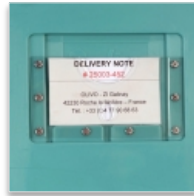
Embedded label holder