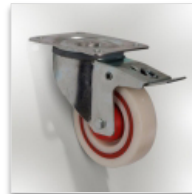
2 braked casters Ø 100 mm