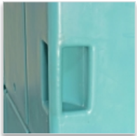
2 embedded moulded handles