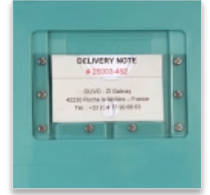
Embedded label holder