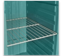
1 to 3 plastic coated steel shelves