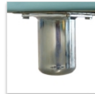
4 metal feet Ø 60 mm