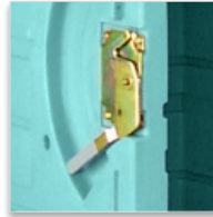
2-points «pelican» quick closing system, rustproof treated