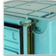
EPDM one-piece frame seal. Door hold-open system.