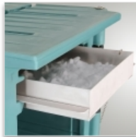
Dry ice drawer