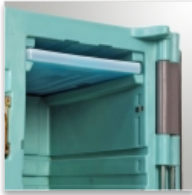
Moulded eutectic plate support