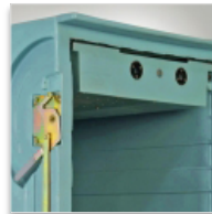
SIBER SYSTEM® dry ice snow tank for chilled and frozen products