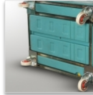
Rustproof treated steel frame, flush mounted, 4 wheels Ø 100 mm, 2 fixed, 2 swivelling