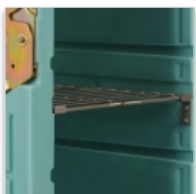
1 to 3 stainless steel shelves